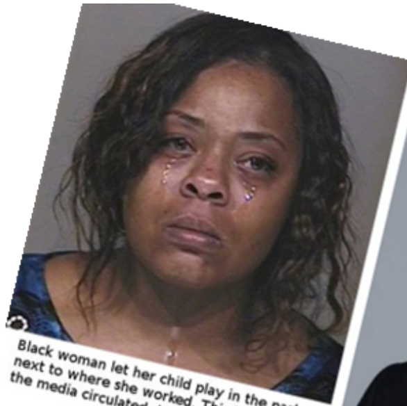
Black woman let her child play in the park next to where she worked. This is the image the media circulated, her mug shot.

"If your girl steps up, I'm smaking the hoe."