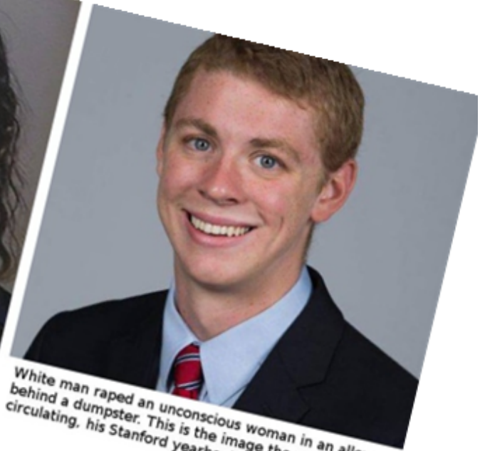
White man raped an unconscious woman in an alley behind a dumpster. This is the image the media is circulating, his Stanford yearbook picture.